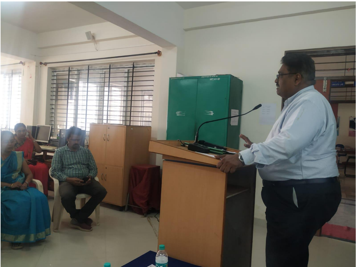
Honourable principal sir addressing the parents and students of 3 rd semester ECE during the Pearent Teahet Meet in EDUSAT HALL.

These are the photos captured when the event was conducted