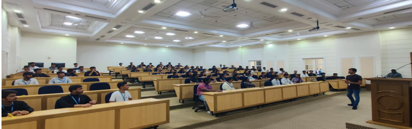
STUDENTS INSIDE THE CLASSROOM ADDRESSED BY MR NANDA KISHOR