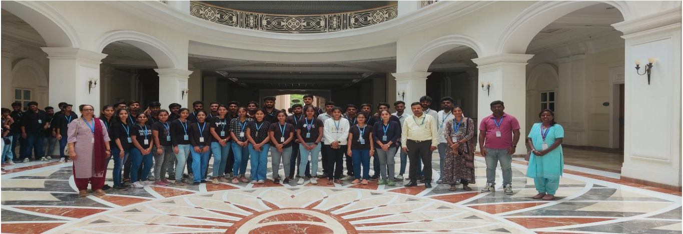
INSIDE GLOBAL EDUCATION CENTER, MYSORE