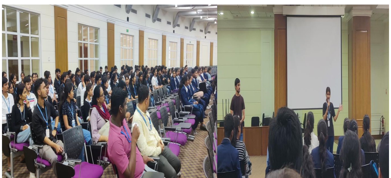
STUDENTS IN INDUCTION HALL